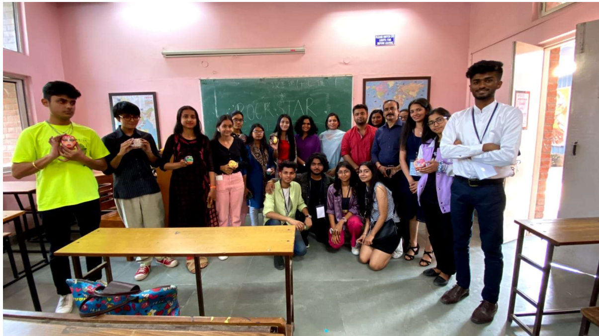
Stone painting competition